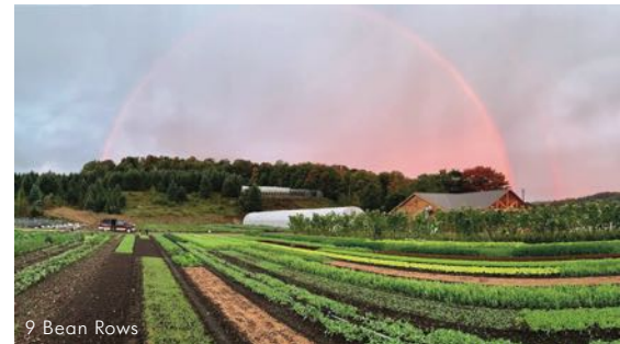
9 Bean Rows