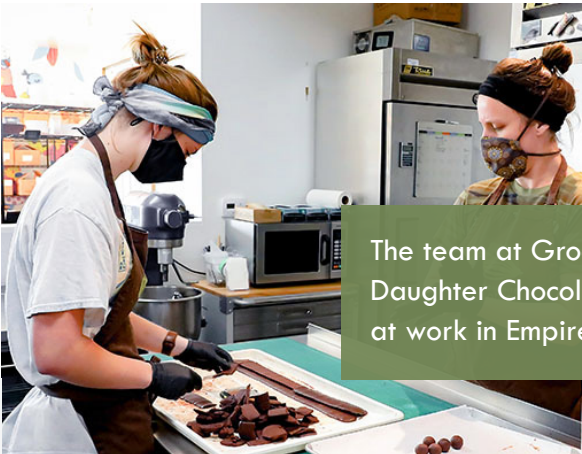
The team at Grocer’s Daughter Chocolate hard at work in Empire.